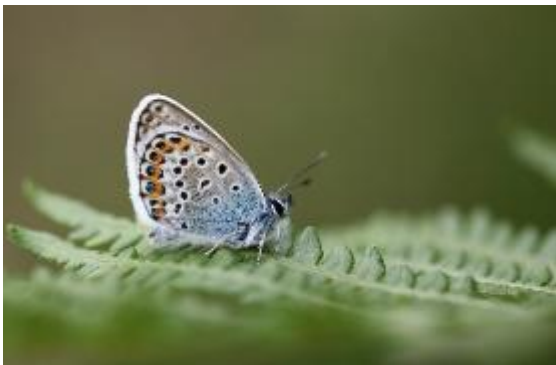
The Silver-studded blue butterfly

This will enhance the landscape and habitat, improving the whole ecosystem. Saving these species and giving them a safer long-term future means expanding and reconnecting the traditional coastal landscapes on which they depend, creating more flower rich fields and highway verges, carefully managed scrub mosaics, strategic hedgerow connections, and more wildlife friendly parks, churchyards, school grounds and private gardens. Our coastline, and its connected hinterland, will be buzzing with wildlife and packed with wild flowers.