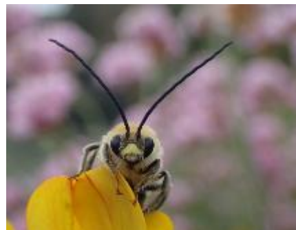
The Long-horned bee

Life on the Edge has walks coming up that may well interest readers.